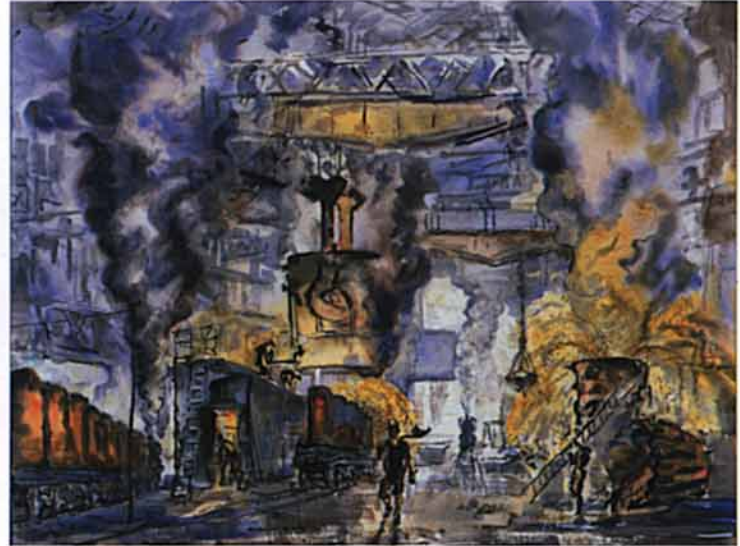
Bethlehem Steel, Open Hearth, Lackawanna , c. 1946-47 WATERCOLOR WITH PENCIL ON PAPER, 22¼ X 29⅞ IN. COLLECTION OF THE BURCHFIELD-PENNEY ART CENTER, GIFT OF THE ARTIST, 1985