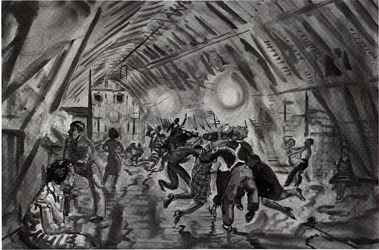
Barn Dance , C. 1939 WATERCOLOR, 26 X 39 IN.