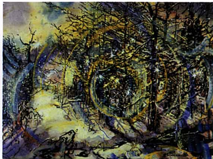
Untitled [Wooded Fantasy], c. 1960 WATERCOLOR AND MIXED MEDIA, 21 X 29½ IN. (SIGHT) COLLECTION OF ALBERT L. MICHAELS