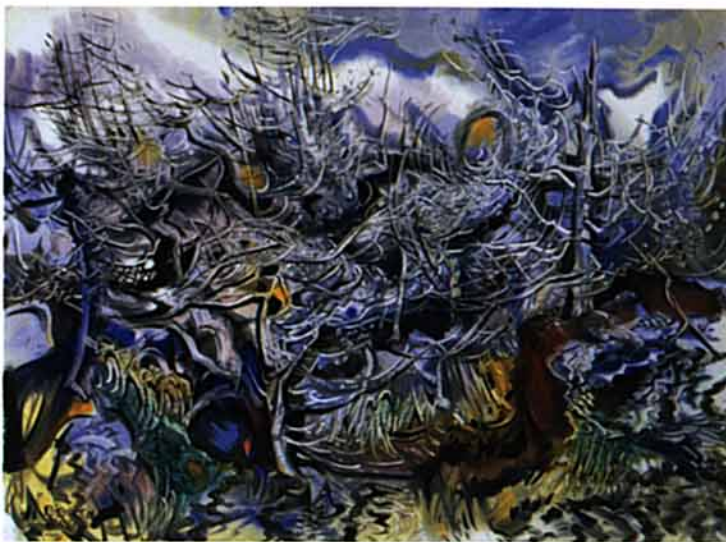
Thorn Bush, 1955 WATERCOLOR, 22½ X 31 IN. COURTESY OF THE ARTIST