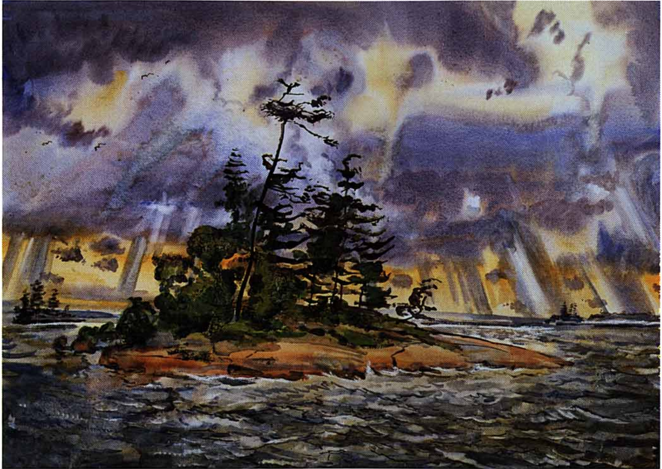
Lake Nipissing, Canada , c. 1980-90 WATERCOLOR, 28 X 40 3 / 8 IN. COLLECTION OF DAVID BLAIR