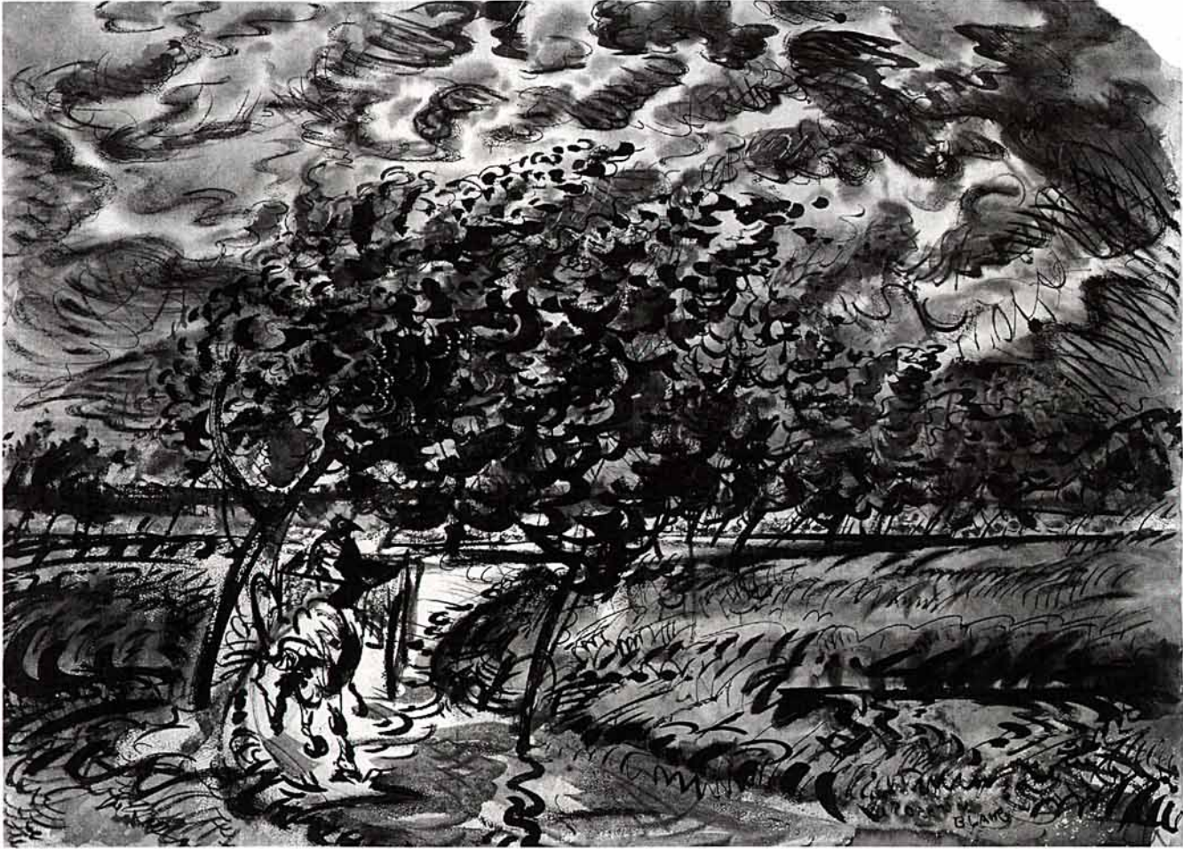
Avenue of Trees , c. 1951 WATERCOLOR, 22 X 30 \frac{3}{4} IN. COURTESY OF THE ARTIST