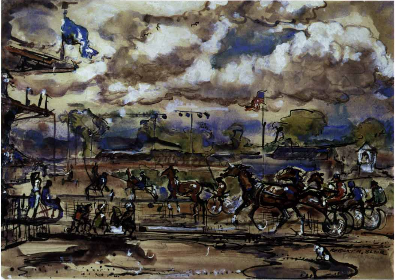
Hamburg Raceway, 1973 WATERCOLOR AND INDIA INK, 15½ X 22 IN. COURTESY OF THE ARTIST