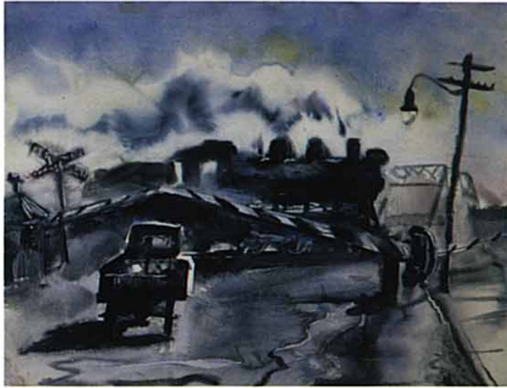
Switch Engine and Truck , c. 1940 WATERCOLOR, 22 X 30 IN. COURTESY OF THE ARTIST