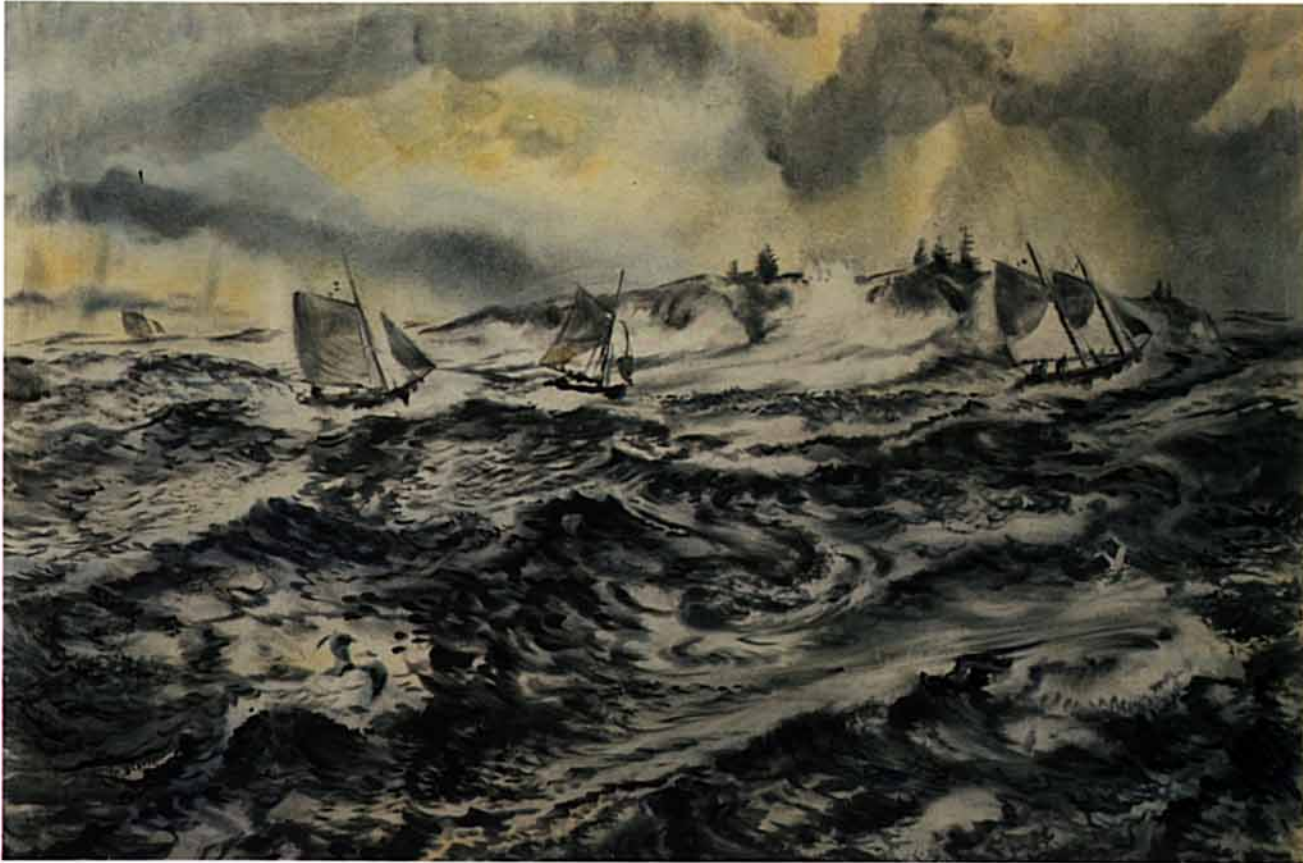
Silver Sea #2, Ocean Point, Maine, 1946 WATERCOLOR, 25 X 37 \frac{3}{4} IN.