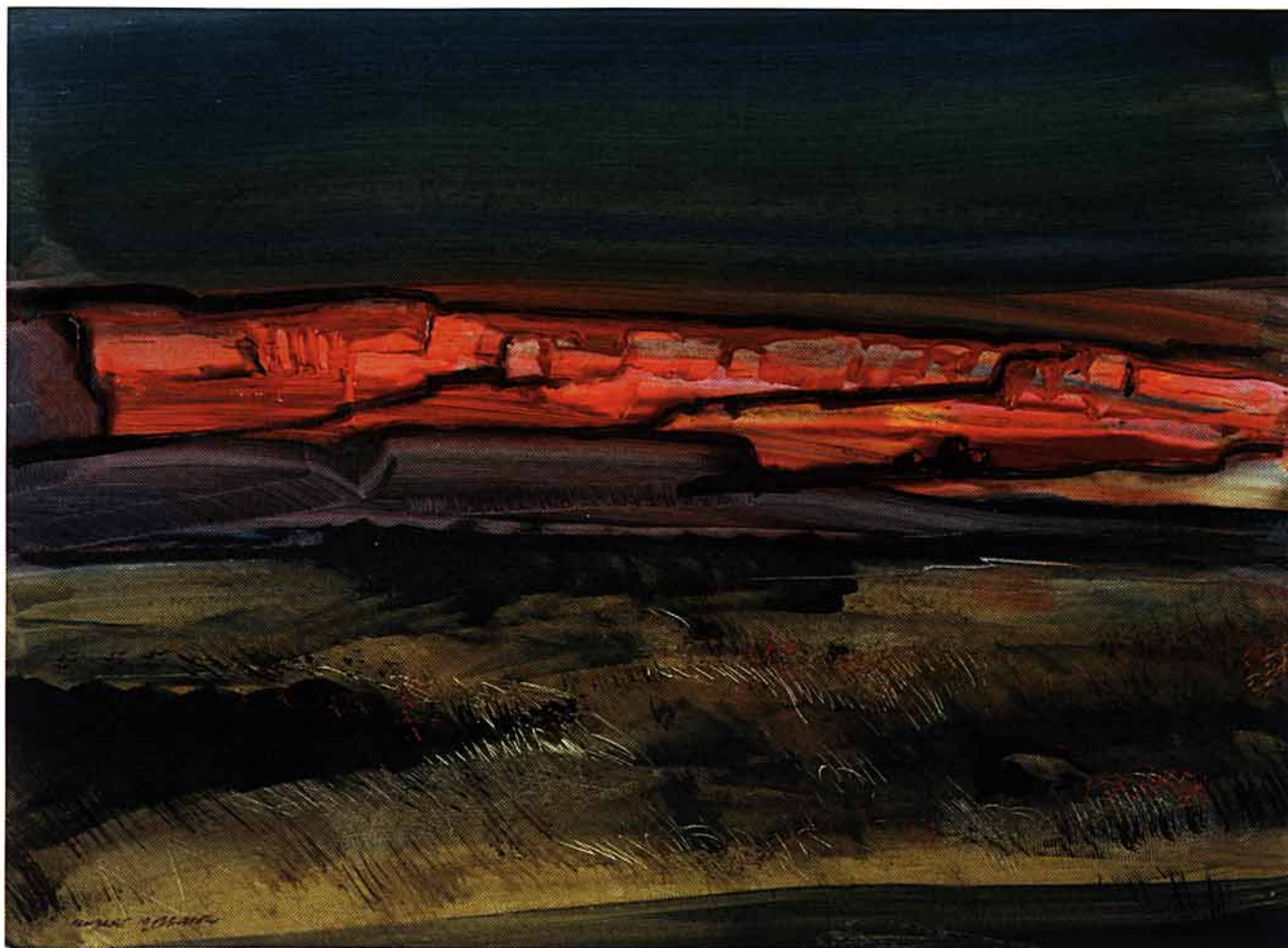
Escarpment , 1972 ACRYLIC AND WATERCOLOR, 22 X 29 \frac{7}{8} IN. COURTESY OF THE ARTIST